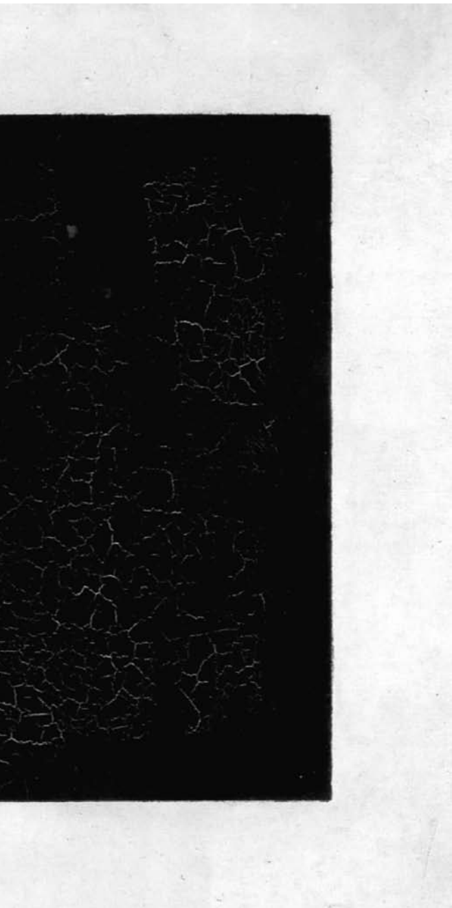
K.S.Maljevič / K.S.Malevich Crni kvadrat / Black Square 1914-1915.